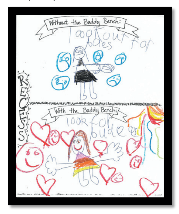
Fig K. Lola, 1st grade

Before the buddy bench, playground lessons were all about bully proofing. How to spot a bully, how to stand up to one, how to assert yourself, how you deserve to be treated... it's like we were arming our children to be attacked. Now, they're headed out to the playground looking for buddies instead of bullies. Rather than worrying about how they're going to get hurt by others, they're looking for how they can help others. It's a completely different outcome. What we feed, we foster.