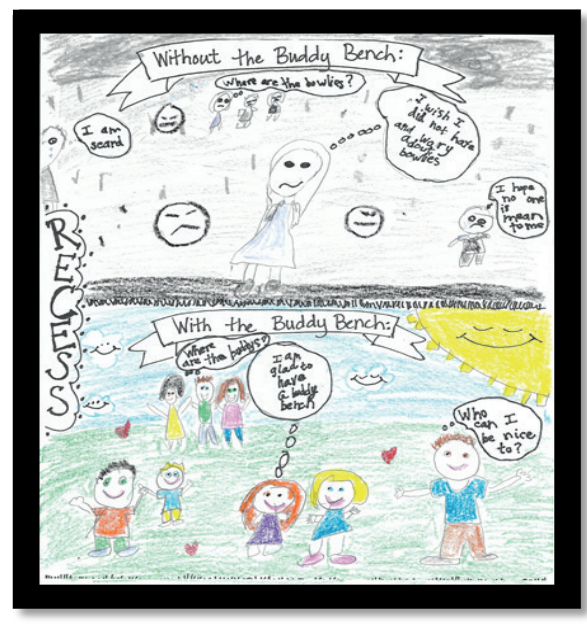
Fig L. Milly, 3rd Grade

These children's drawings express that with the buddy bench the artists perceive an overall climate shift on the playground as children change their overall playground approach from "look for bullies," to "look for buddies."