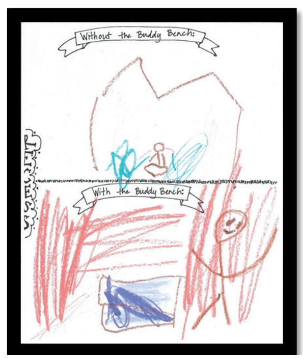
Fig F. Tyler, Kinder

These children's drawings express that prior to the buddy bench being alone on the playground was shameful and made one hide on the playground or in the bathroom, but with the buddy bench you can openly show yourself on the playground and be ready to make a new friend.