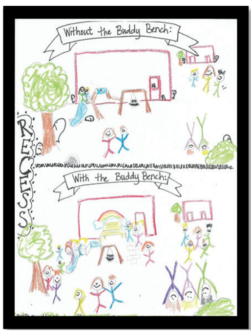
Fig E. Brooklyn, grade 4

But, with the bench, "It's ok if you don't know what to do at recess. It's not embarrassing anymore." She points to the second drawing where the ghosts are now smiling children incorporated into play.