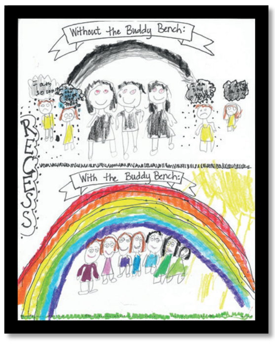
Fig B. By Em, Grade 3

These children's drawings express that prior to the buddy bench these artists felt like being alone on the playground felt like a very isolating, or outsider experience. But, with the buddy bench there is a realization that everyone gets lonely sometimes and we are all in this together.