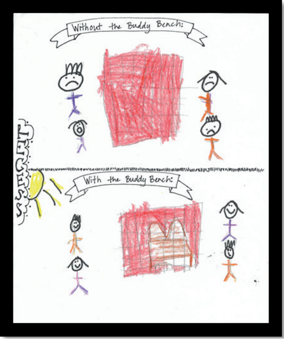
Fig H. Aron, 3rd grade

These children's drawings express that prior to the buddy bench these artists felt like they were stuck playing with the same friends at recess, even when it wasn't enjoyable. But, with the buddy bench, the artists feel empowered to leave less than satisfying interactions and mix up their playmates. This facilitates joyful and fluid interactions.