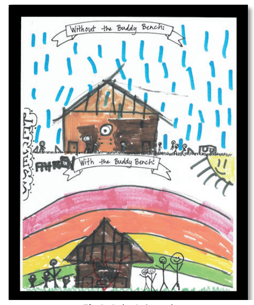
Fig J. Colt, 2<sup>nd</sup> grade

These children's drawings express that prior to the buddy bench these artists have no recourse when they are ousted by friends, but with the buddy bench there is opportunity for selfempowerment in the face of rejection.