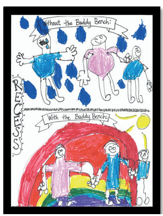
Fig D. By Harper, Kinder

These children's drawings express that prior to the buddy bench these artists felt like being alone on the playground was internalized as a feeling of worthlessness, but with the bench everyone is illustrated as deserving of a friend to play with.